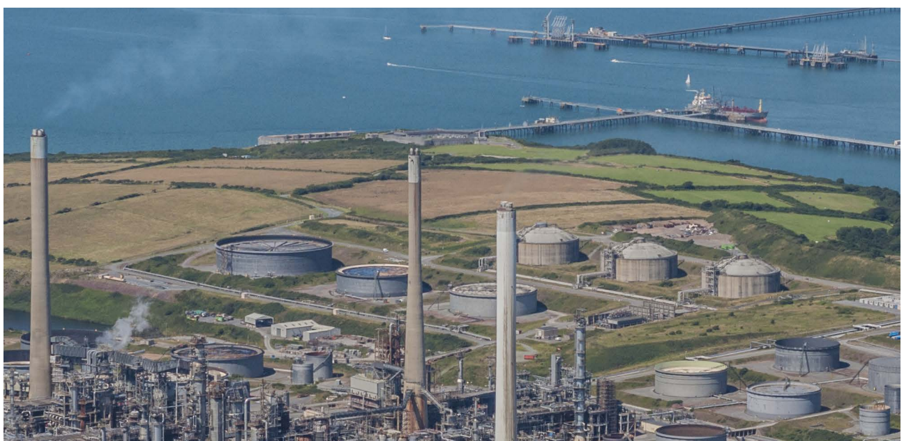
Figure 2: Pembroke oil refinery, on Milford Haven Waterway, forms part of RWE's plans for green hydrogen infrastructure in South West Wales.

Protium is involved in a proposal to install a 17.5MW electrolysis facility alongside a solar farm and a wind turbine at Budweiser's brewery in Magor, Monmouthshire. It undertook an informal community consultation in September 2022, but has not yet sought planning permission for the project.