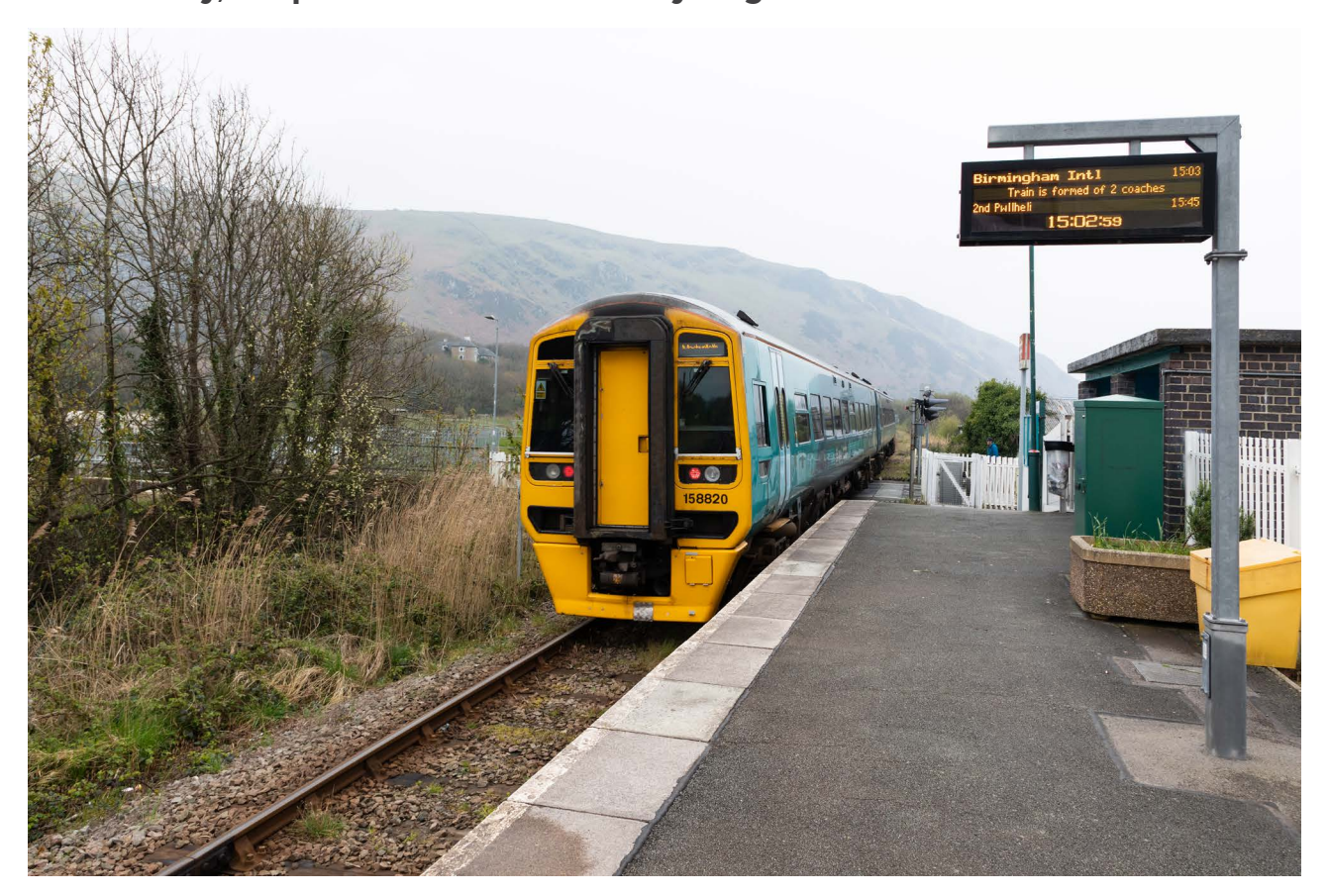
Figure 4: The Cambrian Line, which connects Aberystwyth and Pwllheli to Shrewsbury, is a possible candidate for hydrogen trains.

...identified several rail lines in north Wales as most suitable for trials for hydrogen trains, including the Heart of Wales line, the Cambrian line, the North Wales Coast, and the Conwy Valley lines